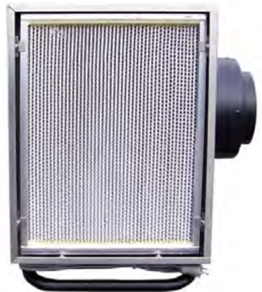
Figure 4. Close up of tabs for HEPA element

Note: HEPA filter gasket must be flat against internal flange.