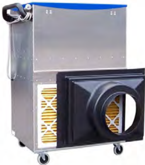
Figure 2. Rear view of the AWX2000PAC:

The PAC system should be connected to containment outlet with flex duct to create a negative or positive pressure in the room. The machine can also provide air purification as a self standing unit if desired.