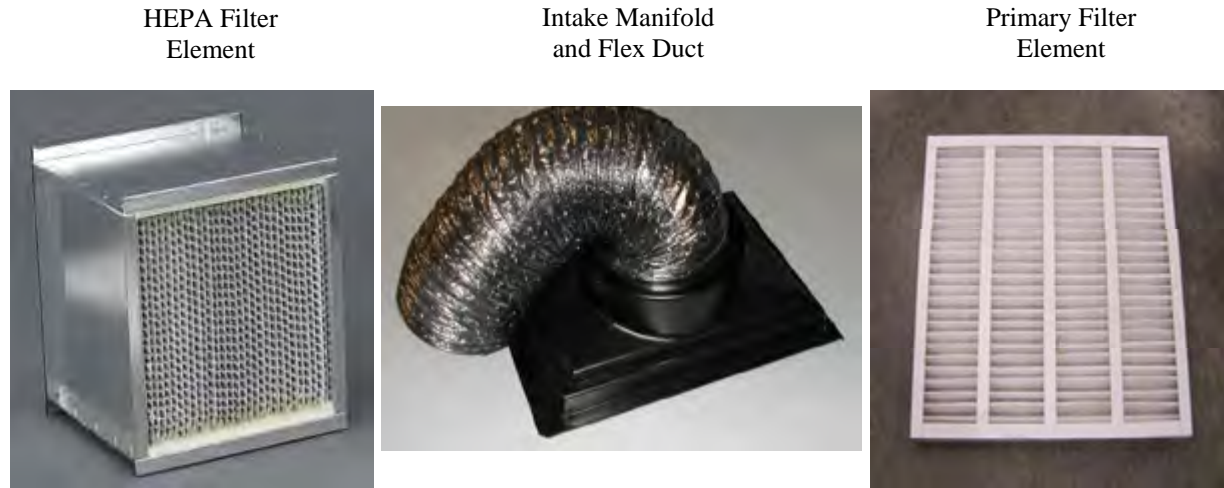
Figure 1. AWX2000PAC Parts and Accessories