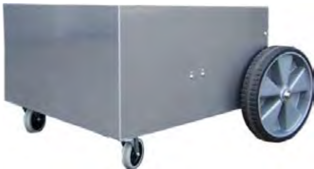
Optional Wheel/Caster combination

Weight: 125 lbs, Size: 40”H X 24”W X 29”D with wheels